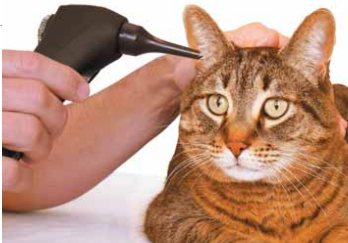
© MANO MÉDICAL - Otoscope sans fil TELE-VIEW® TV-200V