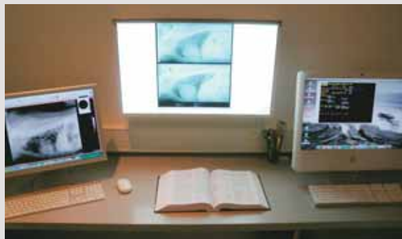
Digital radiology work station.

This symposium aims to answer all your queries, to give you the knowledge essential to make the right choice, to explain that working with digital radiology is unlike working with previous methods of radiology.