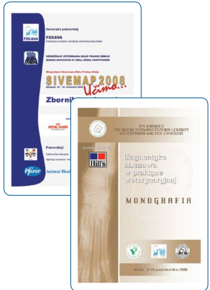
Poland and Serbia were among the countries that received grants from the FECAVA Continuous Education Project in 2008.