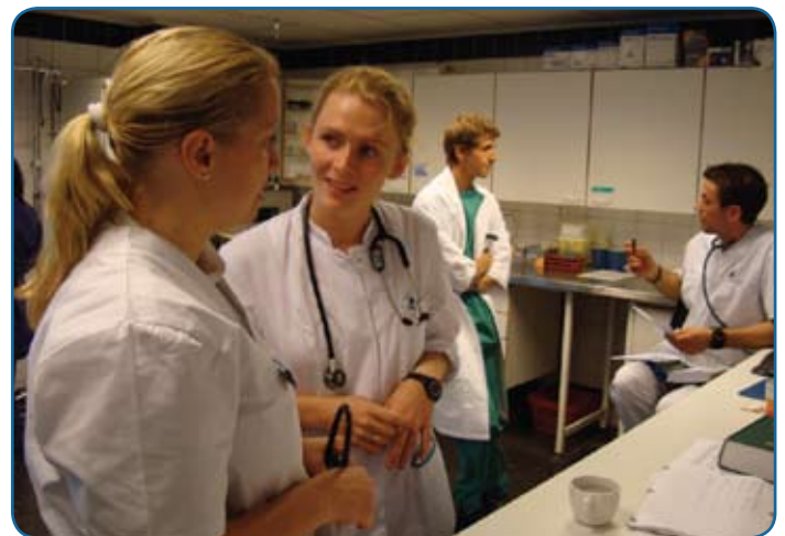
FECAVA is part of a project that aims to develop a pan-European system for clinical examinations.